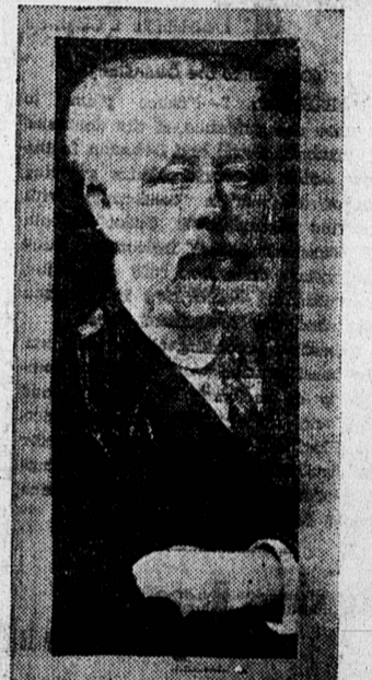
RT. HON. SIR ROBERT BORDEN, K. C. M. G., P. C.