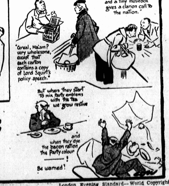
Great, Mabam? Very wholesome, except that each carton contains a copy of Lord Squirr's policy speech. But where they start to mix Party emblems with the tea we grow resentive and when they dye the bacon ration the Party colour! Be warned!