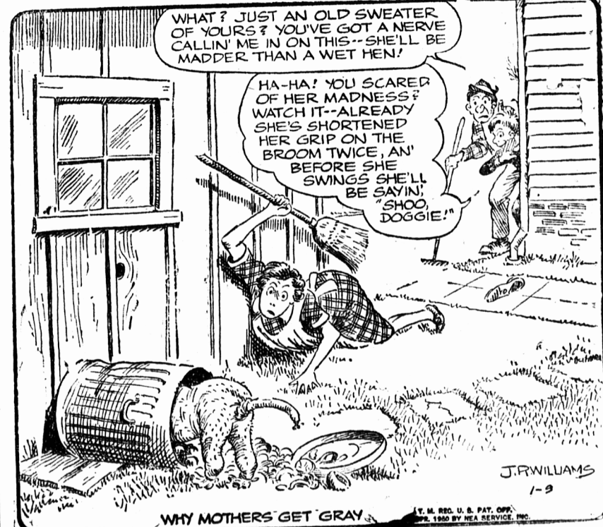
WHAT? JUST AN OLD SWEATER OF YOURS? YOU'VE GOT A NERVE CALLIN' ME IN ON THIS--SHE'LL BE MADDER THAN A WET HEN!