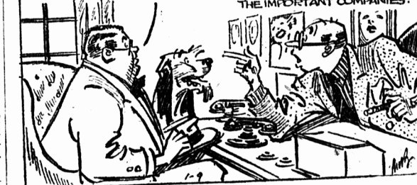
MR. CHIZZLE, YOU WERE SUGGESTED AS AN AGENT FOR MY DOG BY STUPENDOUS STUDIOS.

believes that the unbalance in trade and capital flows "is being aggravated by continued governmental intrusion in private business relations through import and export restrictions and foreign-exchange controls." "The Chamber recognizes the practical difficulties in eliminating such restrictions but goes on respect."