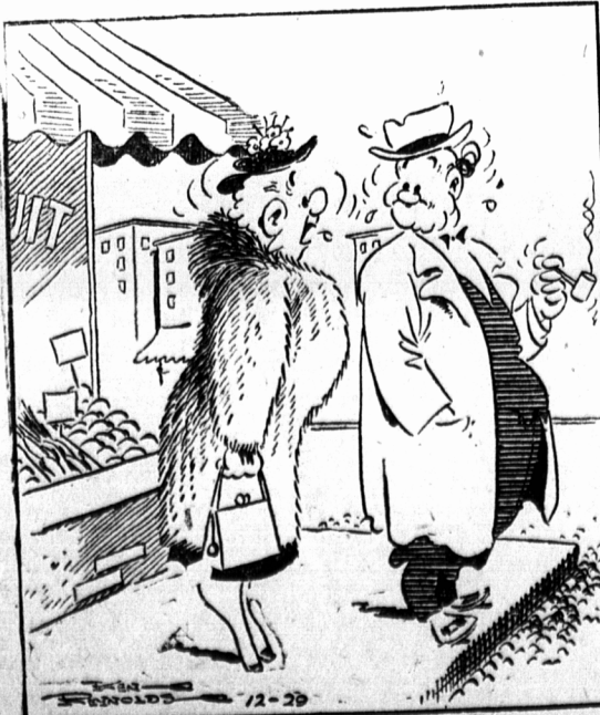
"All of a sudden I get a yen for carrots—are you sure the Guardian Want Ad said this coat wasn't rabbit?"