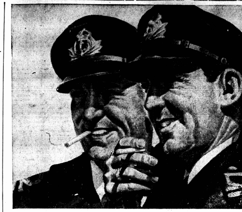
PLAYER'S MILD Pain-hive "Wetproof" paper, which does not stick to the lip

Huge losses in military personnel by Germany and Italy in combat with American, British and French forces during the European war are shown in above map. Total "captured" figure on Western Front includes 3,404,948 disarmed enemy forces. Data does not include losses in war with Russia.