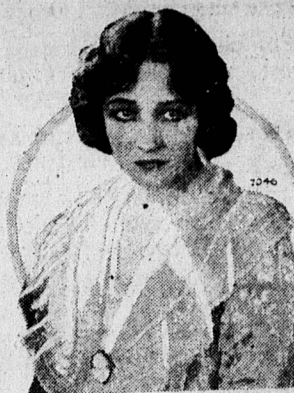
PAULINE FREDERICK in "A Daughter of the Old South" A Paramount Picture

Pauline Frederick IN "A Daughter of the South"