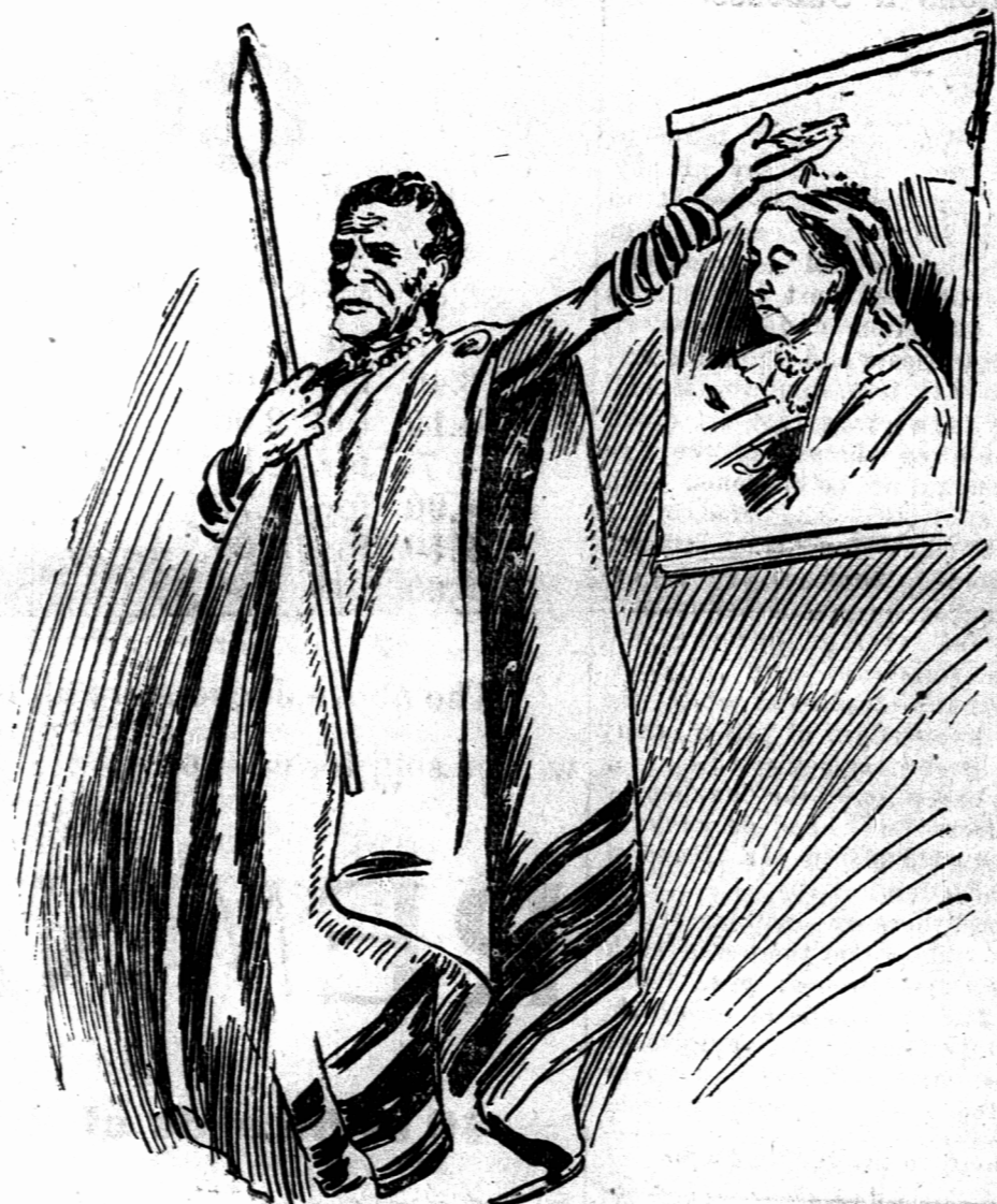
THE TRANSVAAL WAR.

CHICAGO, Nov. 1.—"There is no doubt in my mind that the Republican party will win a decisive victory during the next Presidential campaign," said Representative Mann of Chicago today. "The elections in Kentucky, Iowa, Nebraska, and Ohio have no bearing whatever on the national campaign, and the results will not be an indication of what will happen next year. Local issues of more or less importance figure in the elections of these States, and for that reason I do not see how the results can be construed as having any bearing on the Presidential campaign. It is true, however, if the Republicans should win in Nebraska, Bryan would be more or less overshadowed, but at the same time he would be the nominee of the Democratic party. If the Democrats should happen to win in Ohio, Senator Hanna would be placed in the background to some extent and some of the Republicans would perhaps be frightened at such a result, but next year it will be found President McKinley will be the nominee of the Republican party and Ohio will come to his support."