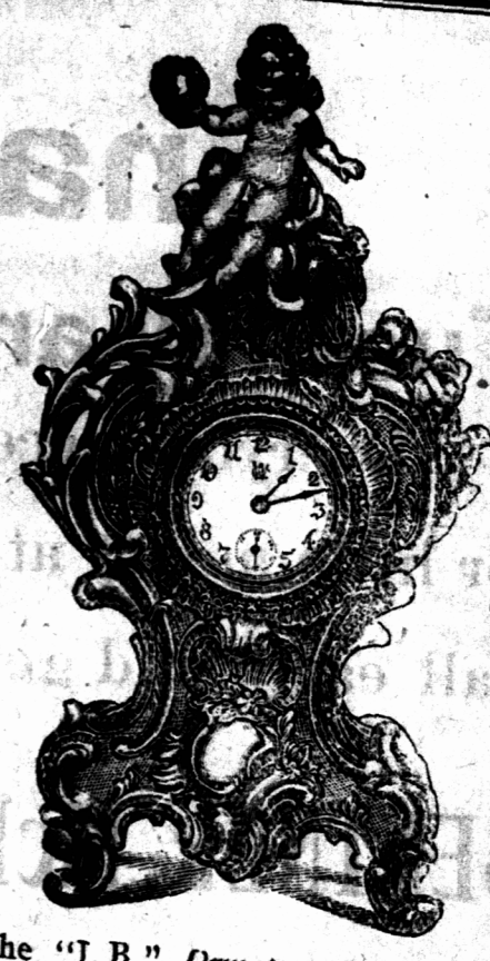
The "J. B." Ormou Gold Clock surpass all others in quality and design. See them at

These folders made of heavy dark colored material, give to a portrait a style and dignity that add greatly to its attractiveness. OUR HOLIDAY SPECIALTY. This year will be ARISTO PLATINO PRINTS WITH FOLDER COVERS