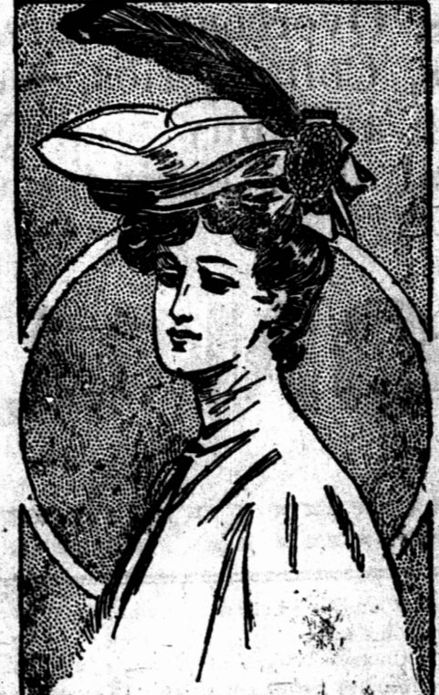
TAILOR MADE HAT.

Turbans Are All the Mode—Hats of Rough Felt. The fall tailor made hats are very smart. Cochs' feathers are very largely used in white, green and shaded red. The shapes are much smaller, and turbans prevail. These are of two kinds. There is the square edged turban made of shirred velvet, with two tabs in the back and a pointed front, and the draped affair which turns up coquettishly in front. The latter is more universally becoming. Hats of rough felt are used for everyday wear with walking suits, and