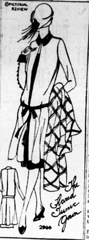
A MOLYNEUX MODEL