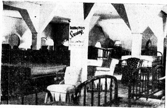
Large Bright Bedding Section on the Second Floor of New Building.