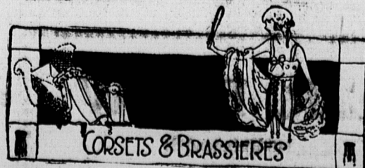
Corsets & Brassieres

The finest assortment in the city, pink, blue, maize, black, mauve, made of silk, wash satin and crepe de chene short sleeve or sleeveless. Sizes 36 to 44 . . . . . $1.15 to $3.75.