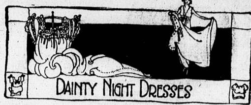
Dainty Night Dresses