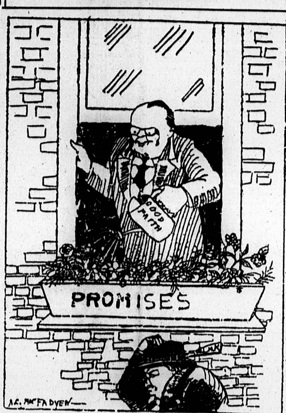
RT. HON. R. B. BENNETT—"Yes, Mr. Man, and all those that have not already bloomed are going to." RT. HON. W. L. M. KING—"Who would have thought it possible?"