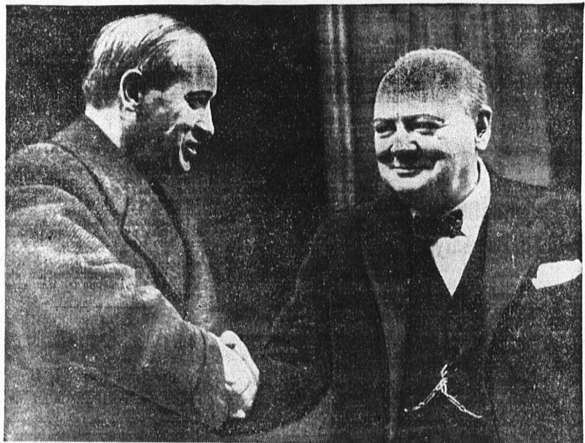
Prime Minister Churchill meets Harry Hopkins, U.S. lease-lend plan chief, reported to be either on his way back from London or now in the United States. He was believed present at the conference which resulted in the joint statement of victory aims. Hopkins one of the most zealous New Dealers from its start, is often termed the president's right-hand man. Prime Minister Churchill arrived safely in England yesterday.