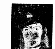
LAWRENCE EARL Standard Staff Photographer in France.