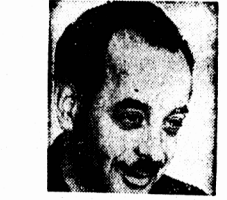
FREDRICK KUH Chicago Sun War Correspondent. Exclusive to The Standard in Canada.