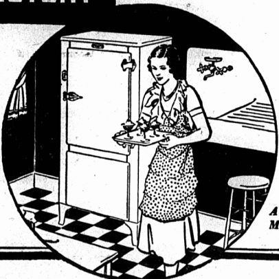
A General Motors Value

The Moraine Model Frigidaire is compactly designed to occupy a minimum of space in the kitchen without sacrificing food storage space. This special design affords more food storage space than any other electric refrigerator of the same exterior dimensions.