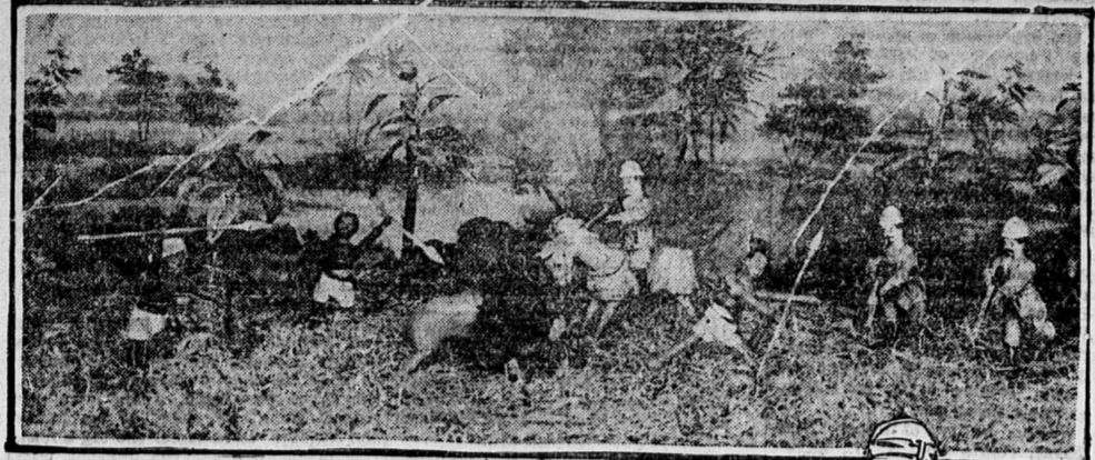
BWANNA HUMPTO RAISED HIS RIFLE, TOOK CAREFUL AIM AND FIRED.

EVERY boy and girl admires colour. In England when a soldier or sailor performs a very brave deed in time of war the king of England gives him a beautiful medal in token of his bravery.