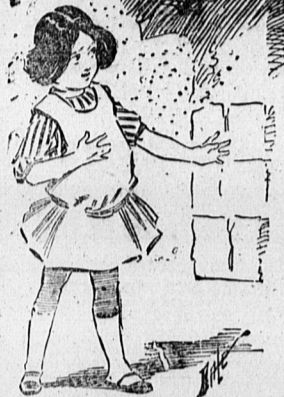
"GLEEFULLY TOSSED CONFETTI."

tripped along narrow sidewalks, Bambina seemed the very spirit of the holiday. Signors and signoras gleefully tossed confetti and flowers down from overhanging balconies upon the head of this saucy, black-eyed baby.