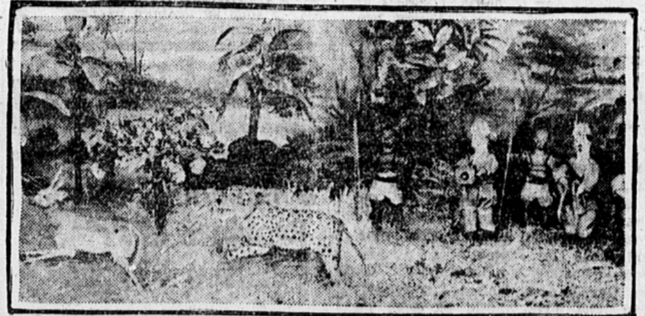
PHOTO'S GAZELLE FLEEING FROM THE CHEETAH. (Photographs posed by figures of Humpty Dumpty Circus.)

Hardly had his father spoken when the boy announced: