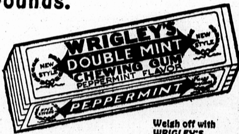
Wish off with WRIGLEY'S

In this pleasant way you get needed body fuel and reduce the pounds.