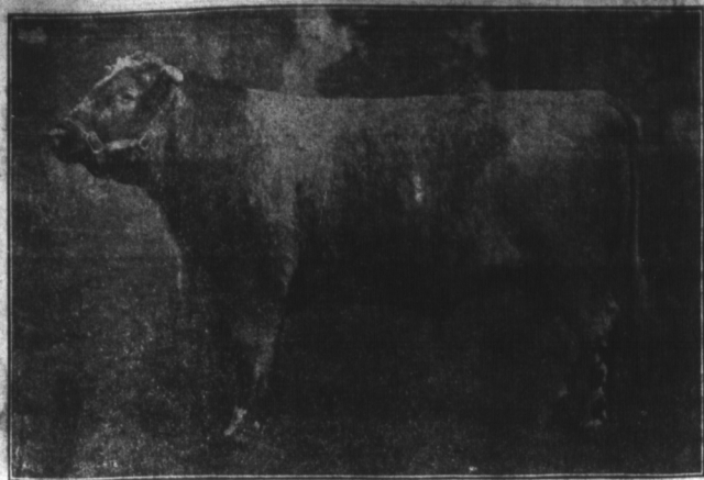
AT THE SHOW—SHORTHORN