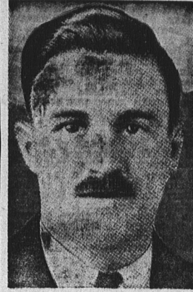
WINS MILITARY CROSS