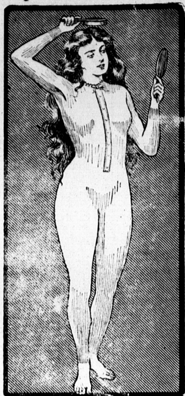
"Stanfield's" PERFECT-FITTING UNDERWEAR