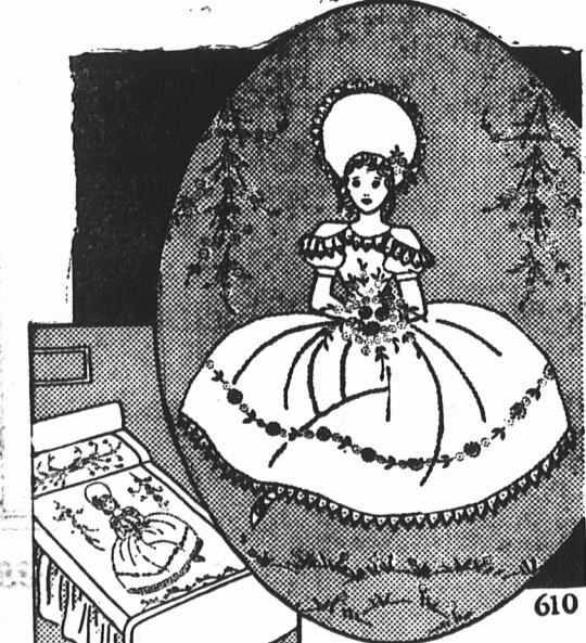
SUNBONNET BETTY BELSPREAD

Miss Aimes receives at least 200 votes for each design before it is accepted for this column. Send us your votes. We print all the popular designs.