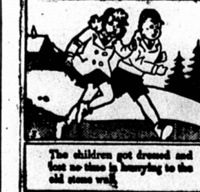
The children got dressed and ran no time in hurrying to the old stone wall.