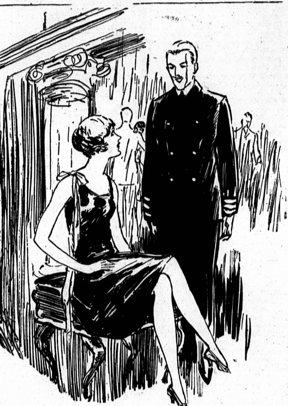
Sally, feeling rather forlorn, was sitting out, when one of the junior officers came up to her

Three days later, Myra knew just exactly what she wanted to do. Not only that, but she was the most popular woman on the ship and the most sought after. Sally never really knew how it had been accomplished, excepting for the fact that she had always known