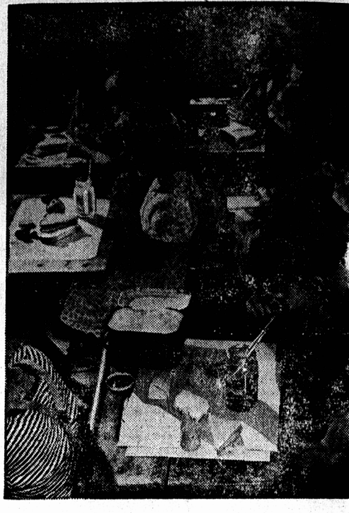
Children of working mothers must take their lunch to school and what goes into the lunch box they carry can make a real difference in their health and in the marks on their report card. Three essentials in every lunch box, according to the Nutrition Division, Ottawa, are milk, a protein food such as eggs, cheese or meat, which may be in sandwich form, and a fruit or vegetable. When possible one food should be hot. In this school where many of the children stay for lunch, each child brings, in a glass jar, food to be heated. At recess the jars are placed in a pan of water on the stove and when the twelve o'clock bell rings the food is piping hot. Cocoa, cream soup, scalloped potatoes and creamed vegetables are favourites with the children.

in the lane hid them from our... RETAIL CONFERENCE