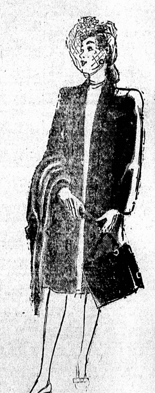
ENSEMBLE BOX COATS

Prime favorite with smart women—the dressmaker box coat! Young and so versatile—turns every dress into an "ensemble." Cocoa Brown. Size 11 1/2