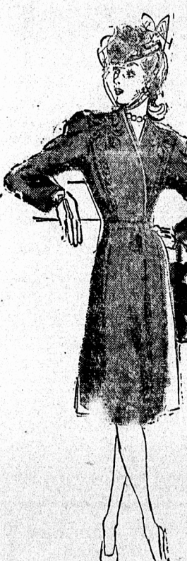
EASTER COSTUME COAT

The fitted dressmaker coat—most fashionable for the Easter parade! With news in collarless, necklines, fresh pique trim. Shell pink only. Size 14