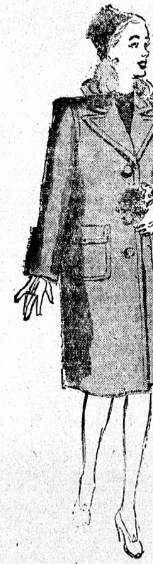
BRIGHT BOY COATS

Vivid color—news for your perennial favorite boy coat! Superbly tailored—Marvellous over everything thru Spring. Color—Gold. Size 10