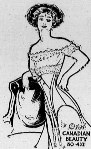
THE CANADIAN BEAUTY NO. 487

They mold the figure to a graceful poise that shows character and distinct individuality. They will make any dress look good and a good one better. $1.00 to 3.45.