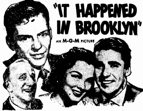
ALSO NEWS - COLOR CARTOON

FRANK SINATRA KATHRYN GRAYSON Sings 7 romantic hits! GOLDEN-VOICED BEAUTY IN LOVE! PETER LAWFORD JIMMY DURANTE Hollywood's new heart-throb! "Schnozzola" funnier than ever!