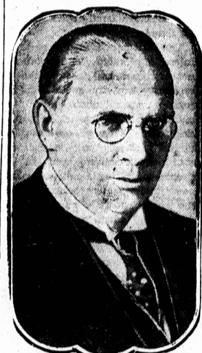
RT. HON. R. B. BENNETT