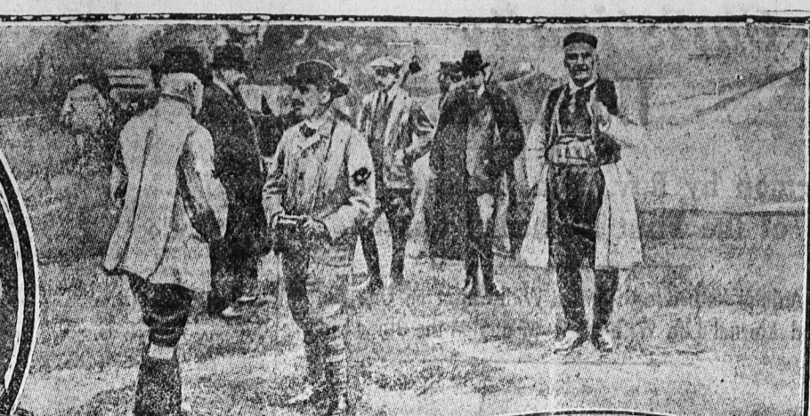
King Victor Emmanuel and Prince Nicholas of Montenegro