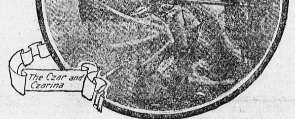
The Czar and Czarina