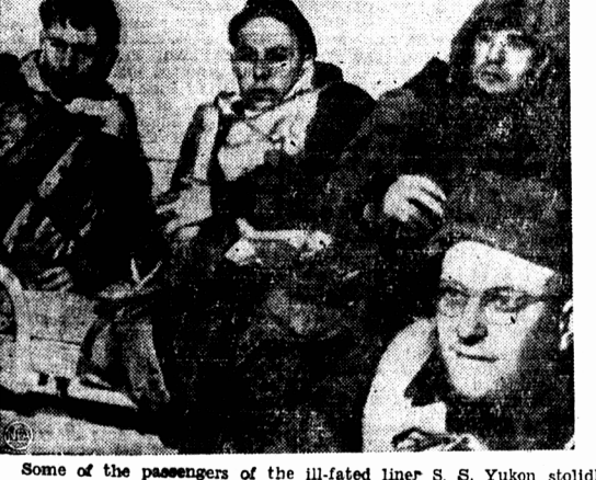
Some of the passengers of the ill-fated liner S. S. Yukon stolidly wait as high seas prevent their rescue. Only their faces show the strain as the vessel's stem is torn away by pounding seas after the ship was driven aground in Johnstone Bay, near Seward, Alaska, during an Arctic blizzard. Four passengers shown above are all soldiers attached to the Alaska Department, who are returning to the United States. The Yukon carried 405 passengers and crewmen.