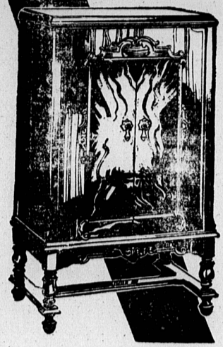
VICTOR RADIO HOME-RECORDING ELECTROLA RE-57 $397.50, Complete with tubes