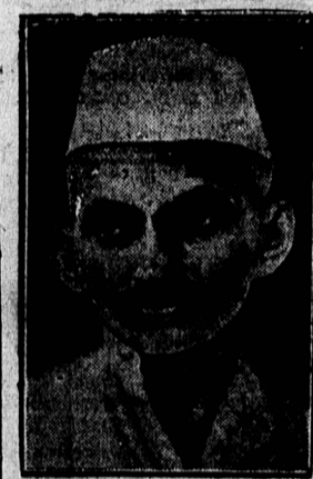
Mahatma Gandhi, Indian revolutionist and mystic, who, with 70 volunteers, commenced a dramatic march to Jalapur to open a campaign of civil disobedience to the British government.