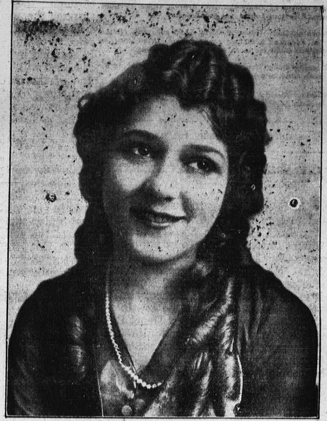
NEW YORK TIMES said: "The fact that Mary Pickford acted the title role in the 'Poor Little Rich Girl' added to the interest of the translation into movie form of one of the most imaginative plays the American stage has produced."