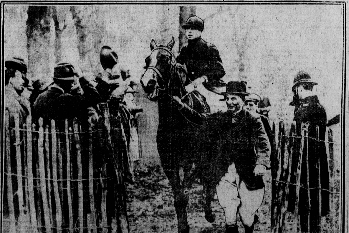
The Prince of Wales, riding his hunter, 'Cark Courtier,' recently won the Manners cup in the Grenadier Guards point-to-point race at the meeting of the Bicester and Warden Hill Hunt at Hillesden, Buckinghamshire. It was his fourth attempt to capture the cup, for which he finished second last year. Photo shows the Prince of Wales being led in after his victory.

WINNIPEG, Man., May 6. — Winnipeg Toilers tonight retained possession of the Dominion basketball championship when, with their margin of four points marked up in last night's game, they defeated the Windsor Collegiate Alumni, 21 to 19. In the first game played Wednesday night the Toilers were the victors, 21 to 17. Tonight's match was a hard struggle throughout, but the Collegians had the better of the play, though unable to overcome the four point margin. On the night's play Winnipeg Toilers won 21 to 19.