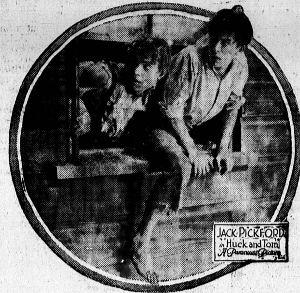
JACK PICKFORD in "Huck and Tom" A Paramount Picture

An epic of boyhood days that will appeal to boys and girls from 7 to 70.