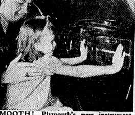
SMOOTH! Plymouth's new instrument panel has all controls recessed... nothing to bump or bruise! Whole beautiful interior designed for safety!