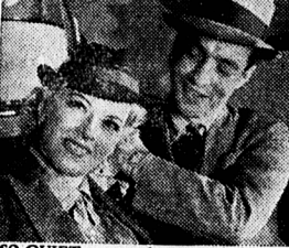
SO QUIET, you can hear a watch tick even in traffic or on rough roads... five kinds of insulating material absorb noise.