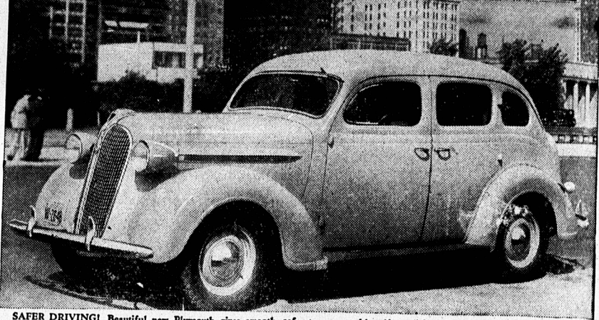
SAFER DRIVING! Beautiful new Plymouth gives smooth, safe stops... with self-equalizing, Double-Action Hydraulic Brakes.