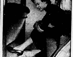
STRETCH OUT... RELAX—in the roomy new Plymouth! Lushness, more leg room, head-room, elbow-room, arm-room! No "hump" in rear floor.

Famous Chrysler Engineering in the Lowest-Priced Field! The genius and vast resources of the famous Chrysler Engineers are back of the ever-growing success of Plymouth. Now, with more length, width and room, Aero-Hydraulic Shock Absorbers, new outrigger-type sound-absorbing body mountings and scientific sound-deadening body insulations, Plymouth for 1937 is the biggest value in Plymouth History.