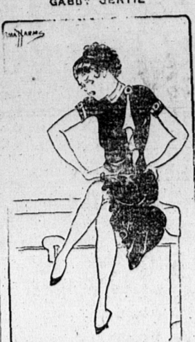
"When you find fault it's usually what you're looking for."