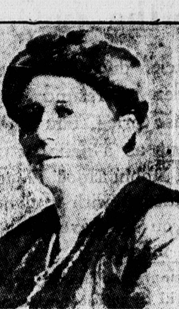
WOMAN RULES A THEATER

(Canadian Press) OTTAWA, Dec. 16.—The Canadian Olympic hockey team defeated an Ottawa all star aggregation here Saturday night by a score of six to two.