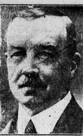
ARTHUR HENDERSON DEFEATED