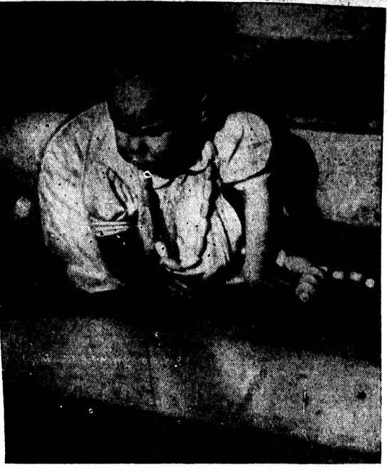
The days of exploration are not over yet, and the view of the mysterious land from the third stair climbed by this baby must be rather puzzling. Having reached the third stair, though, the biggest puzzle of all is how to get down again.

Using a razor blade, carefully scrape from the outside "seams" all protruberances of cement. If there are small missing pieces you will have to fill them in with porcelain cement. Mix this cement with water until a thick paste is obtained. With an orange wood stick apply the paste to the edges of the hole, working slowly and building up and filling the hole. Smooth the surface of the "seams" area and allow to dry for 24 hours. Scrape again, lightly, with "razor blade," smooth down with fine sandpaper and paint with copious shellac. Again dry for 24 hours.