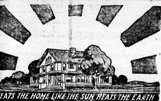
HEATS THE HOME LIKE THE SUN HEATS THE EARTH

LIMITED Riley Building, Charlottetown Montreal Toronto Halifax Saint John Winnipeg Vancouver New York