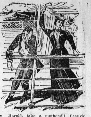
Harold, take a mother's milk Seaside, Cough-sickness I did, and you will feel all right again in a few minutes.

For Sale at Drug Stores. Money refunded if Not perfectly Satisfactory. A remarkable cure has been discovered from all forms of seasickness, car sickness, and all nervousness caused by motion, which has positively never failed.