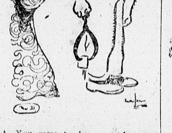
A—You seem to have pretty bad luck with your cooks. B—Yes, the first stayed only three days and the second I can't get rid of.