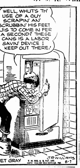
TIPPY AND "CAP" STUBBS