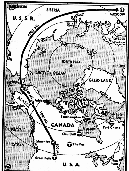
Map above shows secret route flown by at least half of the 10,000 American-built planes sent to Soviet Russia since 1941. Over the 6140-mile course from Great Falls, Mont., to Moscow, a stream of 2300 planes went to the Russian fronts in the first four months of 1944 alone.