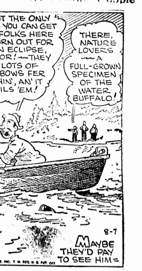
MAYBE THEY'D PAY TO SEE HIM

CAP STUBBS, C'M BACK HERE! I WANT TO ASK YOU SOME QUESTIONS