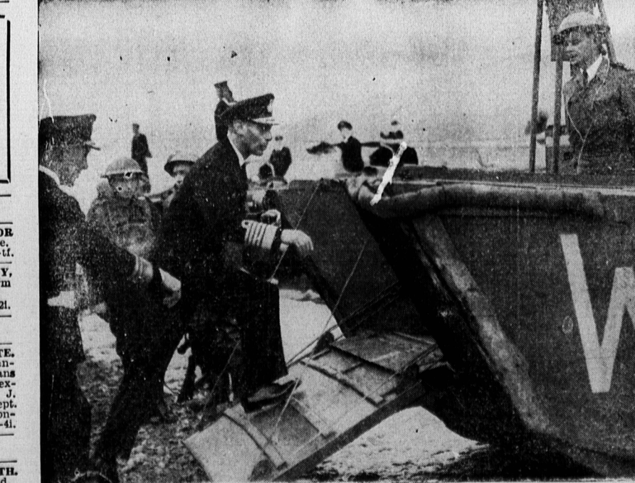
His Majesty King George (LEFT), takes a long step in boarding one of the landing craft from which troops and equipment were later landed on Norway's coast. Secretly trained British "commando" shock troops were used in the raid which wiped out two German

At the Auction warehouse, Graf-21st at 1 p. m. household effects of Miss Anderson including 1 floor lamp; 2 large walnut chairs; 1 small white dresser; 2 white chest drawers; 1 small white table; 1 bed table; 1 oval table (dining); 1 round room table; 1 cane rocker (bedroom); 1 wash stand; 1 mop; 1 wash board; 4 dining room chairs; 3 bedroom chairs; 1 sofa; 2 pillows; 1 small flower stand; 1 Morris chair; also other furniture including 1 trunk; 1 davenport bed; 1 wicker rocker; 1 low chair; 1 whatnot; 1 magazine rack; 1 wardrobe; 2 tables; 2 electric heaters; desk lamp; electric iron; wicker settee and chair; 1 oil stove; 1 Franklin stove; 1 hanging oil lamp; electric light fixtures; 1 cupboard; 1 Daisy churn; 1 Singer sewing machine; 1 No. 11 baseburner; 1 Beatty electric washer; large kitchen-table; small tables; settee; 1 driving sleigh; blankets; beds; springs and mattresses; clothing and many other small articles.