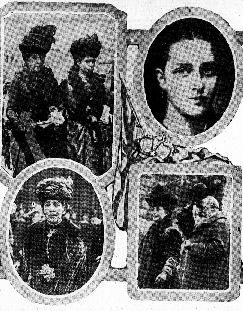
Empire-wide grief is being expressed to the Royal Family upon the death of Queen Alexandra, at Sandringham. The photograph above shows her in one of her most recent pictures. At the right above she is shown with her husband, then Prince of Wales, and below, with her husband.

C. N. R. Net Revenues Show Increase For October (Canadian Press.) MONTREAL, Nov. 25.—For the month of October, 1925, the net revenues of the C. N. R. Railways after payment of operating expenses were $8,139,958, an increase of $3,466,115 over October, 1924, and of $2,974,941 over 1923.