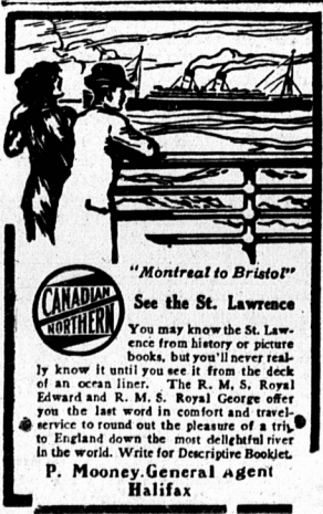
"Montreal to Bristol" See the St. Lawrence