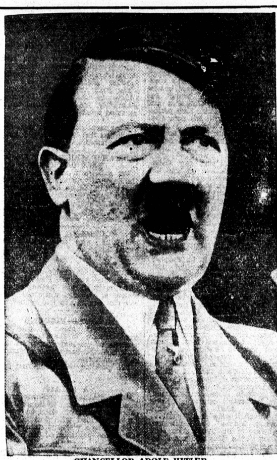
CHANCELLOR ADOLF HITLER

Who has assumed control of the German Army in the greatest administrative and cabinet shake-up since he took office in 1933. The changes have greatly strengthened the radical Nazi element in the Government.