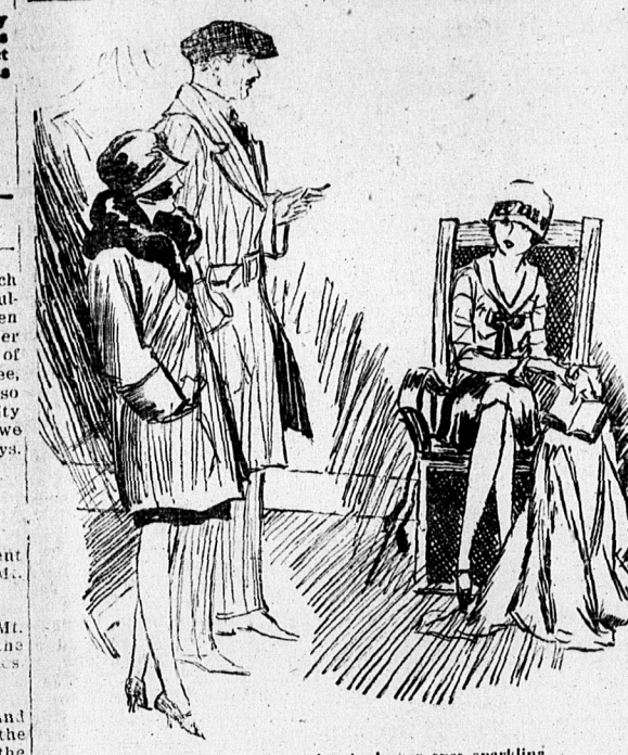
She looked on from her book, her eyes sparkling