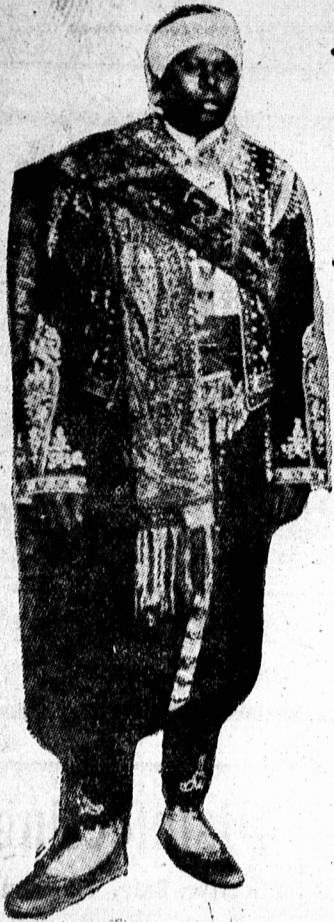
THE MAJAD OF JAORA

Lord Curzon's Unique Body of Soldiers Composed of India's Native Monarchs