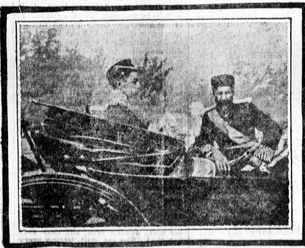
THE AMIR OF AFGHANISTAN'S SON, SUDAR INAYATULLA KAHN, IN CALCUTTA.