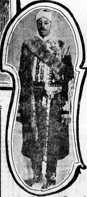
THE RAJAH OF RUTLAN

Militarism is the backbone of all aristocracy. Behind the noble stands always a sword, and that sword which bestows the fundamental sign of nobility is also significant of the fact that but for the sword there would be no aristocracy. Judged by nobility's own trade-mark, the Japanese were, as usual, thoroughly logical when they gave to their nobility not only one sword, but two.