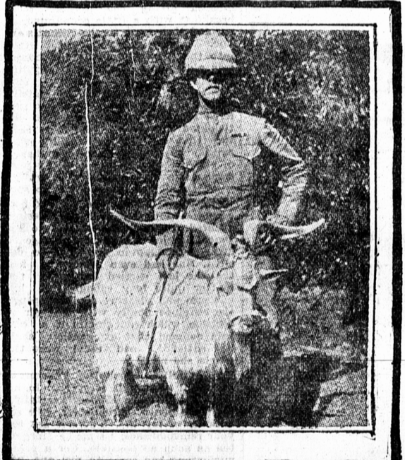
THE PRINCELY MAJAD