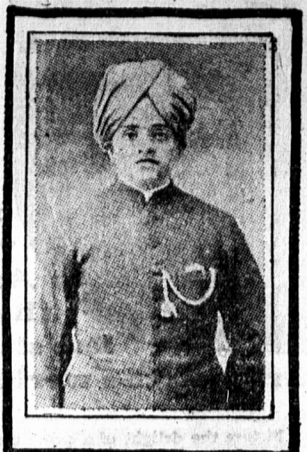
THE RAJAH OF MYSORE