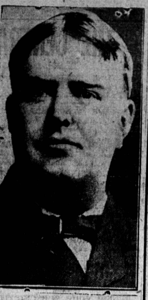
Ban Johnston, president and organizer of the American League, whose job is said to be in jeopardy. It is reported that he will be asked to resign at this week's special meeting of the American League, which is being held in New York. Johnston has been in ill health for some time and unable to handle the duties of his office to the satisfaction of the club owners.

Even trouble gets disgusted with a lay man in time and quits.