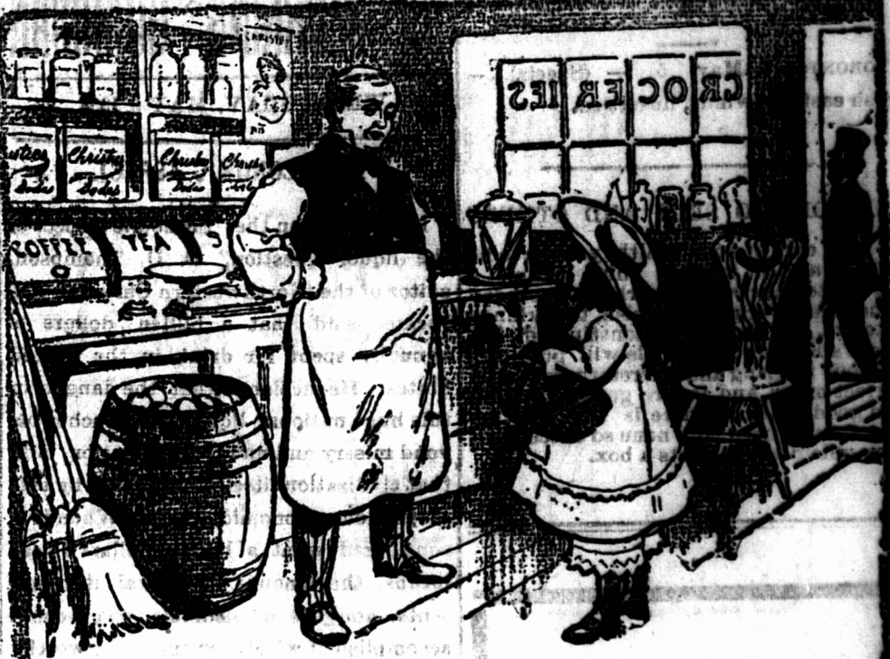
CHRISTIE'S 50 YEARS AGO